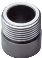
ZAA 1738 xx