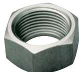
VAA 0038 xx